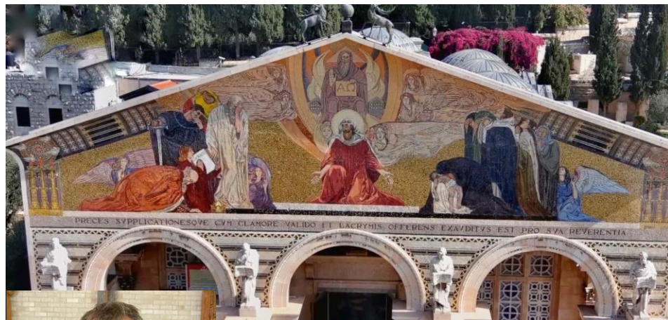
Church of All Nations- Gethsemane- Jerusalem

The Holy Land Road to Emmaus is a must walk for every Christian!